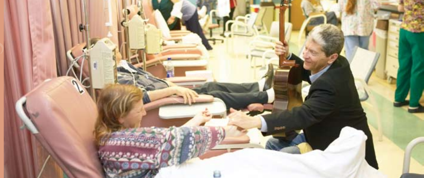
Woven Harmony

With a year-round season, University of Florida Performing Arts programs world-class and developing artists and ensembles in its three venues: the 1,750-seat Phillips Center for the Performing Arts, 850-seat University Auditorium, and 100-seat Baughman Center. More than 125,000 patrons attend performances annually and take part in educational outreach opportunities, including pre- and post-performance discussions, master classes, workshops, school-day performances, and residencies.