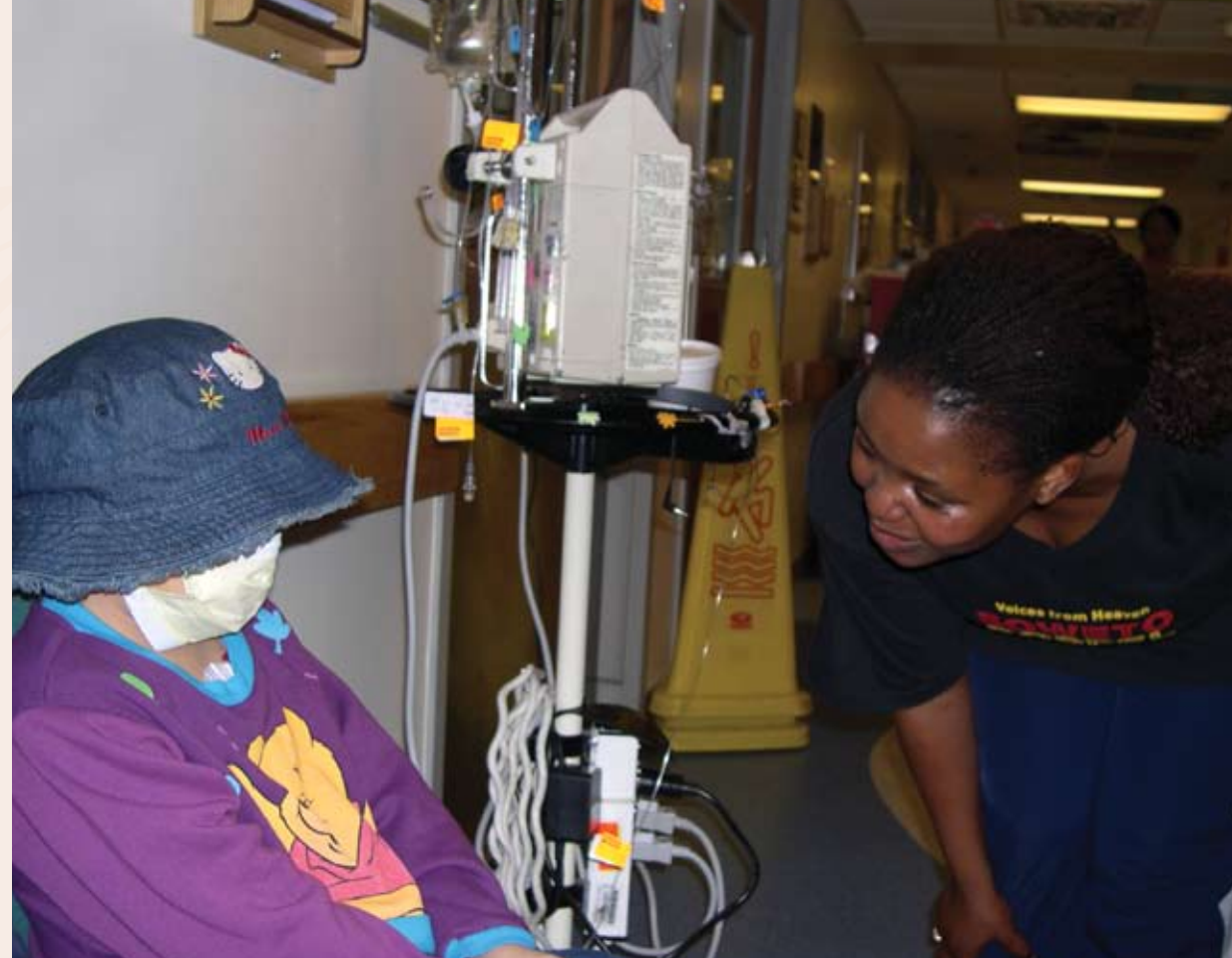
Soweto Gospel Choir

In 2006-07, through funding from the Florida Division of Cultural Affairs, the AIM Together Florida program seeded five new partnerships based on the UF/Shands model in Orlando, Jacksonville, Miami, Tallahassee, and Tampa. Major funding was also provided by the National Endowment for the Arts to support a full-scale healthcare-based season in Gainesville including nine AIM Together residencies.